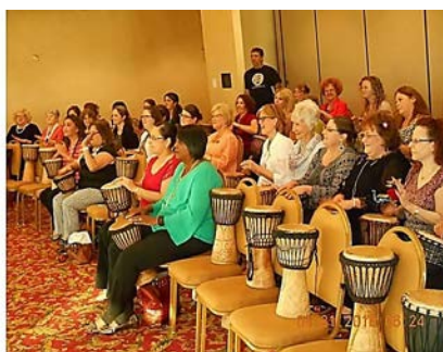
Such a talented group! We've got rhythm.